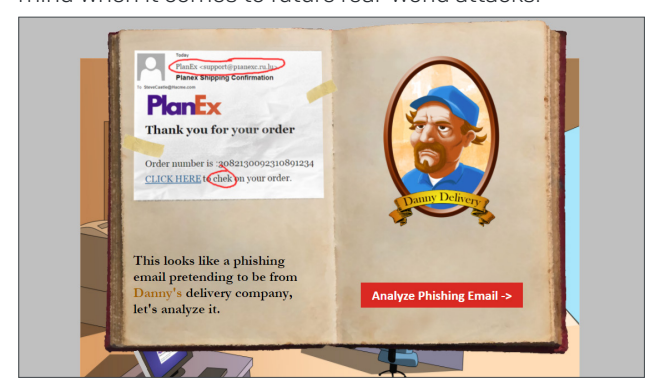
Engage users with a selection of interactive training modules

Over 60 interactive training modules will educate users about specific threats, such as suspicious emails, credential harvesting, password strength, and regulatory compliance. Available in a choice of 10 languages, your end users will find them informative and engaging, while you'll enjoy peace of mind when it comes to future real-world attacks: